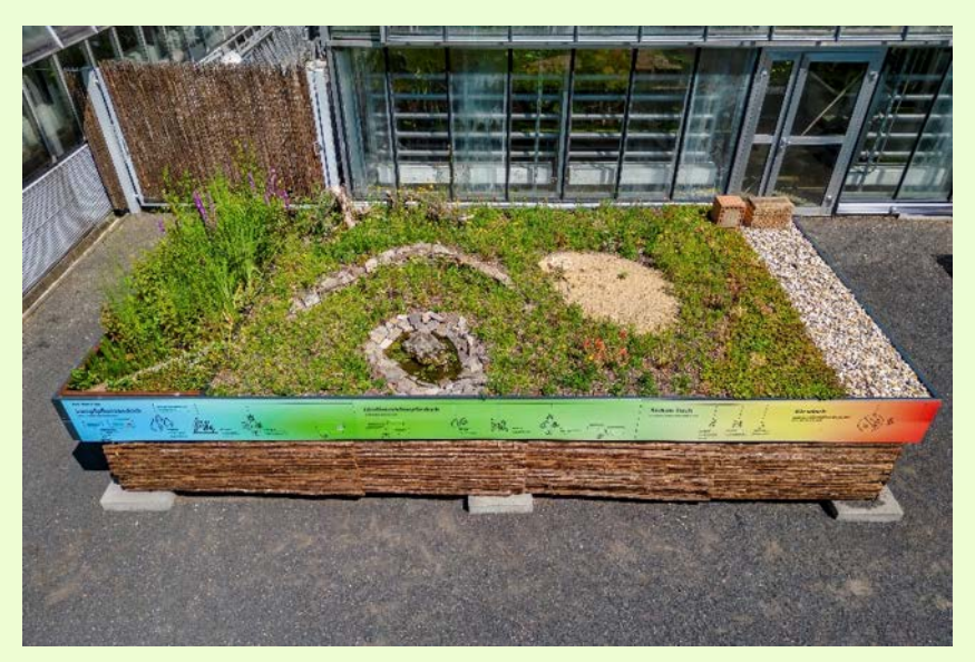
The model green roof in the Botanic Garden

The aim of the exhibit is to introduce interested citizens to the numerous functions of a green roof and to present the possibilities of green roof design. The model green roof in the Botanical Garden has already been reported on in the 15<sup>th</sup> UFZ Green Roof Research Newsletter.